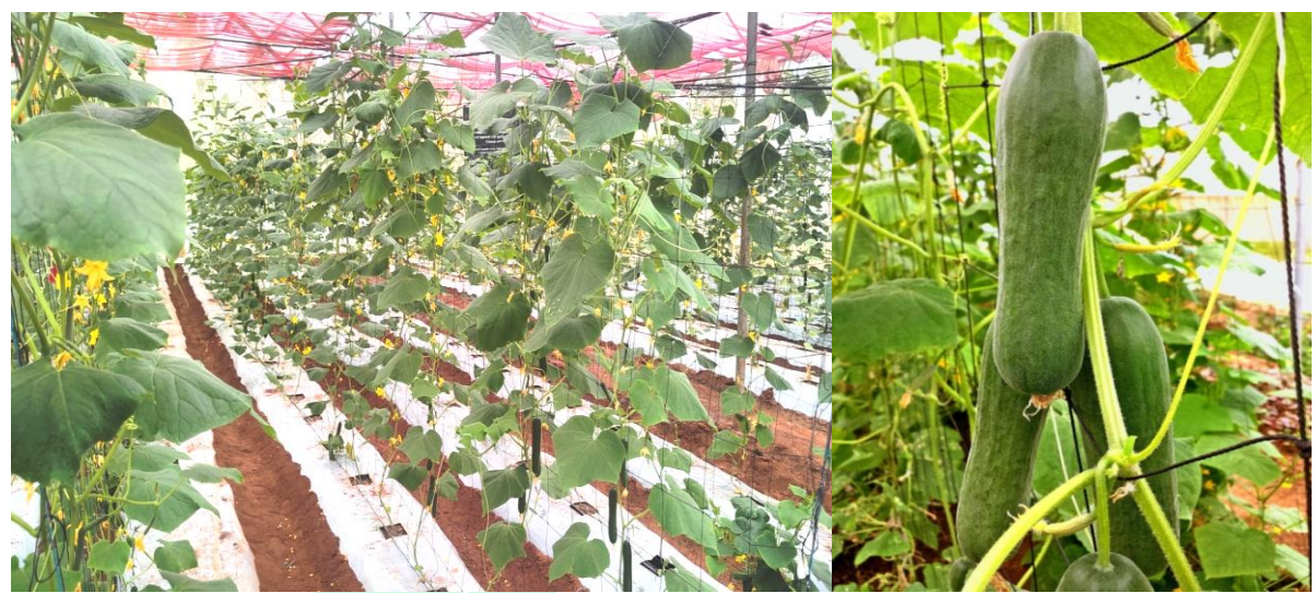
KPCH-1 raised in polyhouse